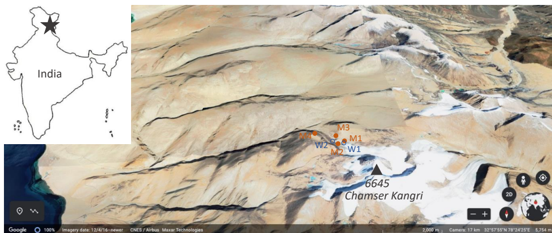
Figure 1: Chamser Kangri glacier forefield chronosequence in India (adapted outline map from coloringhome.com) with sampling sites (M for soils and W for stream water and glacier snout) indicated on a satellite map (35°57'55" N 78°24'25" E. © Google Earth, CNES / Airbus Maxar Technologies, April 12 2016). Orange and open blue rings designated sites of soil and water, respectively.

The soils had a coarse-grained structure, with 30-50% of gravel and a pH between 7.8 and 8.5 (Rehakova et al., 2011). The parent rock consists mainly of metasedimentary siliceous rocks, the Tso Morari granite gneiss (Epard and Steck, 2008). The cold steppe vegetation cover is sparse, characterized by alpine grasslands mainly constituted by hemicryptophytes (Dvorský et al., 2015, 2011). The environmental conditions give rise to an extensive development of soil biological crusts dominated by cyanobacteria, which cover up to 40% of the soil surface in this area, and facilitate the initial establishment of vascular plants (Čapková et al., 2016; Řeháková et al., 2017). Cyanobacterial communities ( Nostocales , Chroococcales and Oscillatoriales ) were observed to be more abundant and species-rich in bare than vegetated soils (Řeháková et al., 2017). Together with Cyanobacteria, Gram-positive spore-forming bacteria ( Actinobacteria and Firmicutes ) were the main recorded bacterial clades (Řeháková et al., 2015).