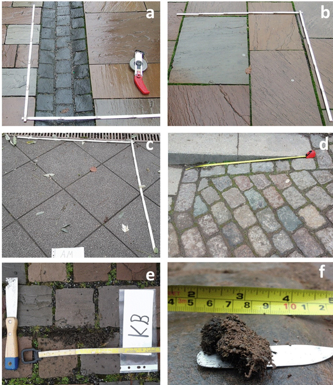
Figure S1: Pavement types and joints at different sampling sites. a) One square meter sampling point at sampling site ZH with street drainage channel (sandstone and basalt pavement); b) One square meter sampling point at sampling site EK (sandstone pavement); c) One square meter sampling point at sampling site AM with drainage gutter (concrete pavement); d) Sampling point at site MP with slope and mixed pavement types; e) Pavement joints between sandstone pavement at sampling site KB; f) Pavement joint substrate at sampling site MP.