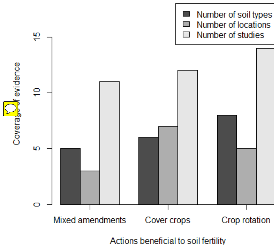
15 Figure 1. Coverage of soil type, geographical location and number of studies for the three actions identified as beneficial to soil fertility. Mixed amendments = amend with a mix of organic and inorganic amendments; cover crops = grow cover crops when field is empty; crop rotation = use crop rotation.

For some actions, several of the practitioners on the Expert Panel were surprised that no negative effects had been reported and questioned why actions such as 'change the timing of ploughing' were not common practice if there were no negative side effects. For other actions, panel members identified known negative side effects from their own knowledge, and also suggested additional studies, but these were not included in the assessment. The majority of these actions fell into the 'trade-offs' category, where evidence suggested that the actions were either beneficial in specific circumstances, or considered likely to be beneficial but with strong negative side effects.