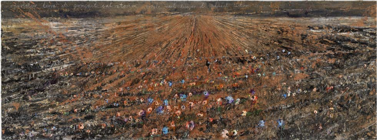
Figure 04. Aperiatu Terra et Germinet Salvatorem, 2005-2006. Anselm Kiefer.

Aperiatu Terra et Germinet Salvatorem [“Let the earth be opened and send forth a Savior”] (2005-2006). The painting was done with oil, acrylic, emulsion, shellac and clay on canvas with colored flowers gathered at the bottom evocating the new birth of life (Fig. 04).