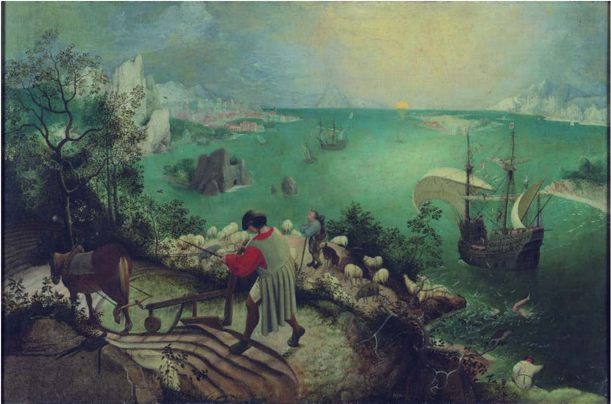
Figure 02 La chute d'Icare (The Icarus Fall) , circa 1568, Bruegel P.I., Musées Royaux des Beaux-Arts de Belgique, Brussels, Belgium (Inv. 4030).

triumph of daily working life over Utopia (“falling from the sky”). Besides the ploughman serving as a reference for agriculture, Bruegel the Elder did not fail to symbolize other of the world’s riches — animal husbandry in the form of the shepherd leaning on his staff, and the wealth of the sea shown in the form of a busy fisherman. It should be also noticed that forked roots are included in the agricultural profile — perhaps meant to be mandrake!