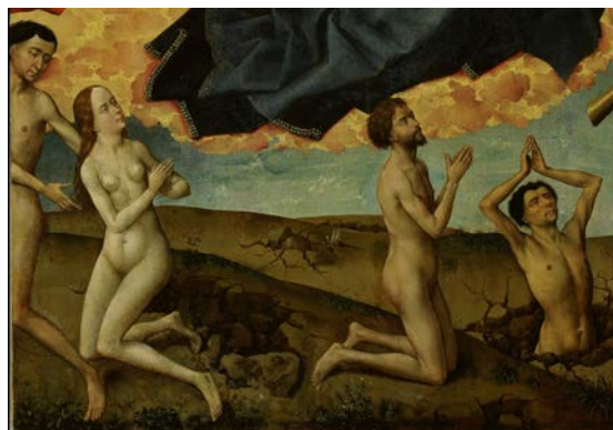
Figure 01. Details of Le Jugement Dernier ( The Last Judgment ), circa 1432, Van der Weyden R., Musée Hôtel-Dieu, Hospices Civils de Beaune, Beaune, France (© Hospices de Beaune).