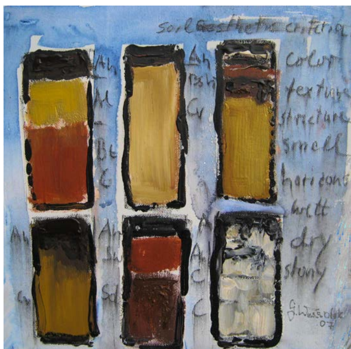
Figure 07. Soil Aesthetics Criteria , 2007. G. Wessolek. (Courtesy of the artist).

Paintings by soil scientists are a way of presenting soil scientific concepts in a visual way. Fig. 07 explores formal aesthetic features (color, texture, structure, composition of horizons) to describe soil properties. Such aesthetic features are often used in field descriptions for soil mapping but are not referred to as such. Capturing the profile in a painting is an exercise in aesthetic observation and documentation that allows the field scientist or student to capture subtle details not possible in tabular, written form.