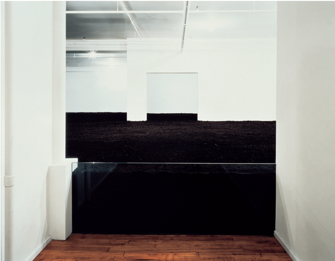
Figure 08. Walter de Maria, New York Earth Room, 1977. Long-term installation at 141 Wooster Street, New York City.