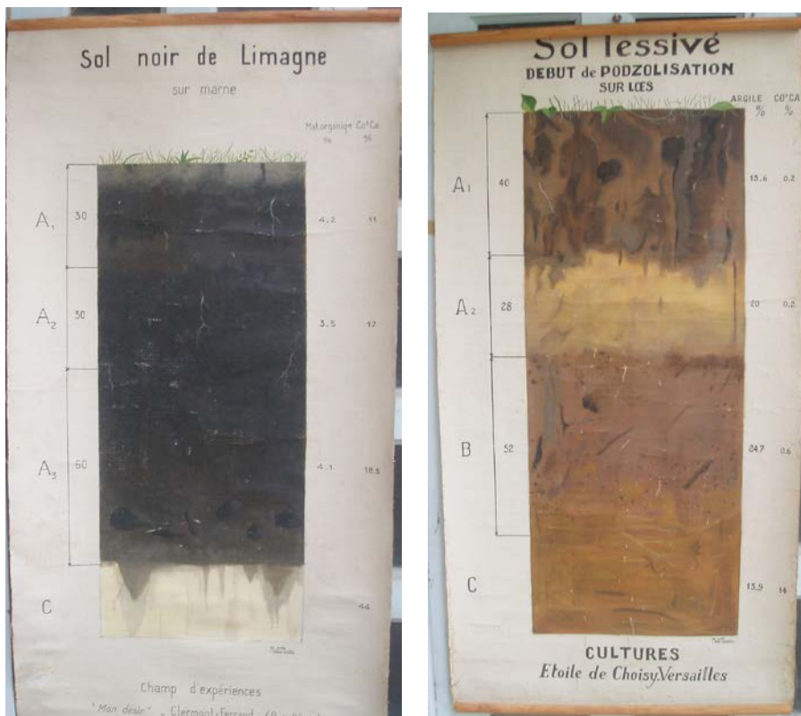
Figure 06. Paintings of soil profiles used by A. Demolon and colleagues for their lectures in Paris (in the 1940's). Unknown artist. Left: "Vertisol" from region Centre (Clermont-Ferrand, France); right: "Luvisol" from region Ile de France (Versailles, France) (Private collection).

exhibitions in lecture halls, generally as canvases representing different types of soil (Fig. 06).