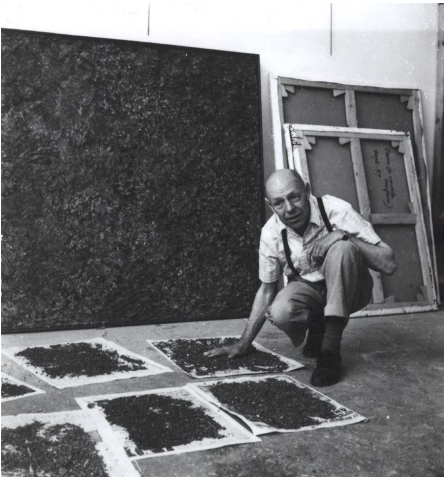
Figure 03. Jean Dubuffet with soil (1958).

“...J’entends par là une nouvelle série de ‘tableaux d’assemblages’ représentant des morceaux de sols...” (“... I mean by that a new series of paintings representing an assembling of pieces of soils... ”).