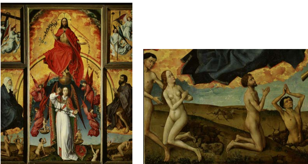
Figure 01. Details of Le Jugement Dernier ( The Last Judgment ), circa 1432, Van der Weyden R., Musée Hôtel-Dieu, Hospices Civils de Beaune, Beaune, France (© Hospices de Beaune).

In the Last Judgment by Rogier Van der Weyden (1432) (Fig. 01) the resurrection of the dead required the artist to show the soil profile. The complete painting exhibits numerous soil profiles. Details of the emergence of men and women from soil profiles (lower part of the painting) are so true to reality that they might have been painted by a pedologist.