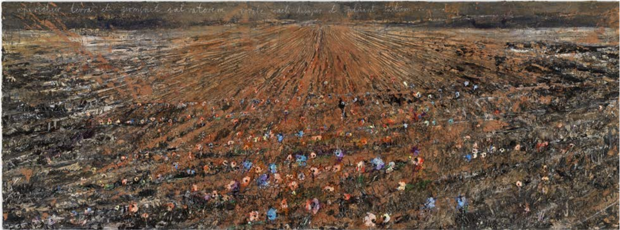
Figure 04. Aperiatu Terra et Germinet Salvatore, 2005-2006. Anselm Kiefer.

Aperiatu Terra et Germinet Salvatore [“Let the earth be opened and send forth a Savior”] (2005-2006). The painting was done with oil, acrylic, emulsion, shellac and clay on canvas with colored flowers gathered at the bottom evocating the new birth of life (Fig. 04).