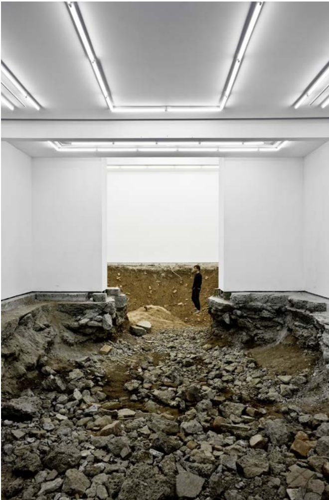
Figure 09. Urs Fischer, You , 2007. Excavation, gallery space, 1:3 scale replica of main gallery space. Dimensions variable Installation view, “ You ”, Gavin Brown's Enterprise, New York, 2007. Collection of The Brant Foundation, Greenwich, Connecticut (© Urs Fischer. Courtesy of the artist and Gavin Brown’s Enterprise, New York. Photo: Ellen Page Wilson).

Thirty years later and only ten blocks away, Swiss artist, Urs Fischer, “installed” a formal antithesis of de Maria’s Earth Room by excavating rather than depositing about the same amount of earth from the depths of Gavin Brown’s gallery floor and inviting the viewer to actually enter into the work of art at his or her own risk.