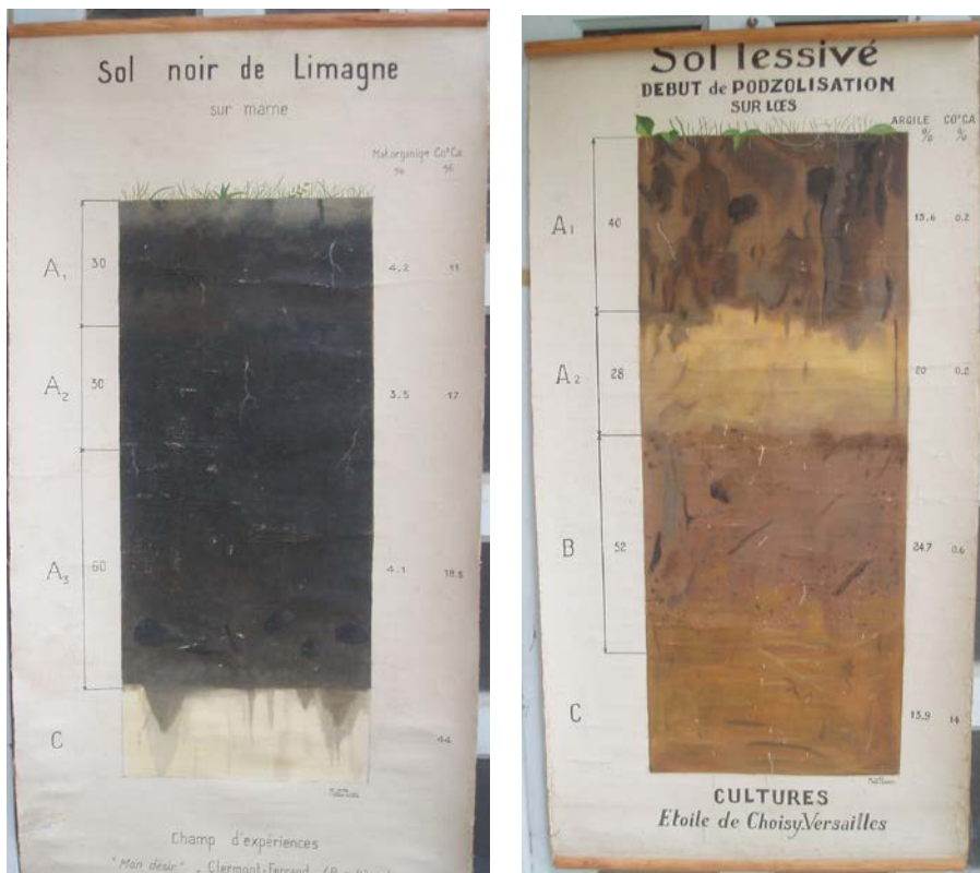
Figure 06. Paintings of soil profiles used by A. Demolon and colleagues for their lectures in Paris (in the 1940's). Unknown artist. Left: "Vertisol" from region Centre (Clermont-Ferrand, France); right: "Luvisol" from region Ile de France (Versailles, France) (Private collection).

exhibitions in lecture halls, generally as canvases representing different types of soil (Fig. 06).