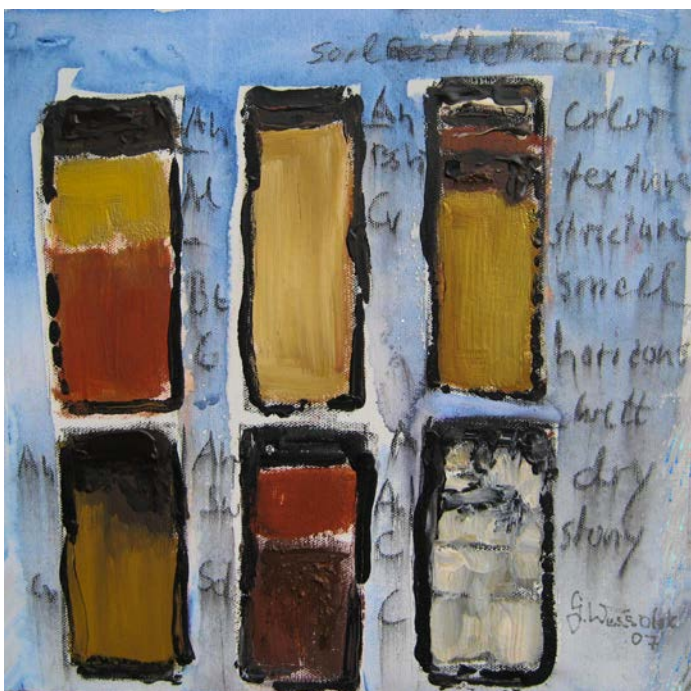
Figure 07. Soil Aesthetics Criteria , 2007. G. Wessolek. (Courtesy of the artist).

Paintings by soil scientists are a way of presenting soil scientific concepts in a visual way. Fig. 07 explores formal aesthetic features (color, texture, structure, composition of horizons) to describe soil properties. Such aesthetic features are often used in field descriptions for soil mapping but are not referred to as such. Capturing the profile in a painting is an exercise in aesthetic observation and documentation that allows the field scientist or student to capture subtle details not possible in tabular, written form.