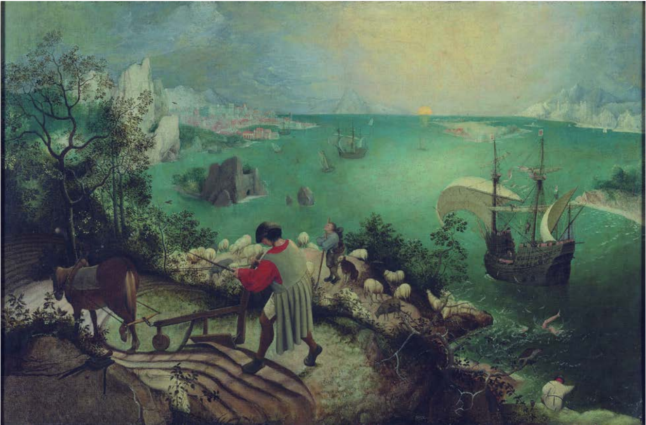
Figure 02 La chute d'Icare (The Icarus Fall) , circa 1568, Bruegel P.I., Musées Royaux des Beaux-Arts de Belgique, Brussels, Belgium (Inv. 4030).

triumph of daily working life over Utopia (“falling from the sky”). Besides the ploughman serving as a reference for agriculture, Bruegel the Elder did not fail to symbolize other of the world’s riches — animal husbandry in the form of the shepherd leaning on his staff, and the wealth of the sea shown in the form of a busy fisherman. It should be also noticed that forked roots are included in the agricultural profile — perhaps meant to be mandrake!