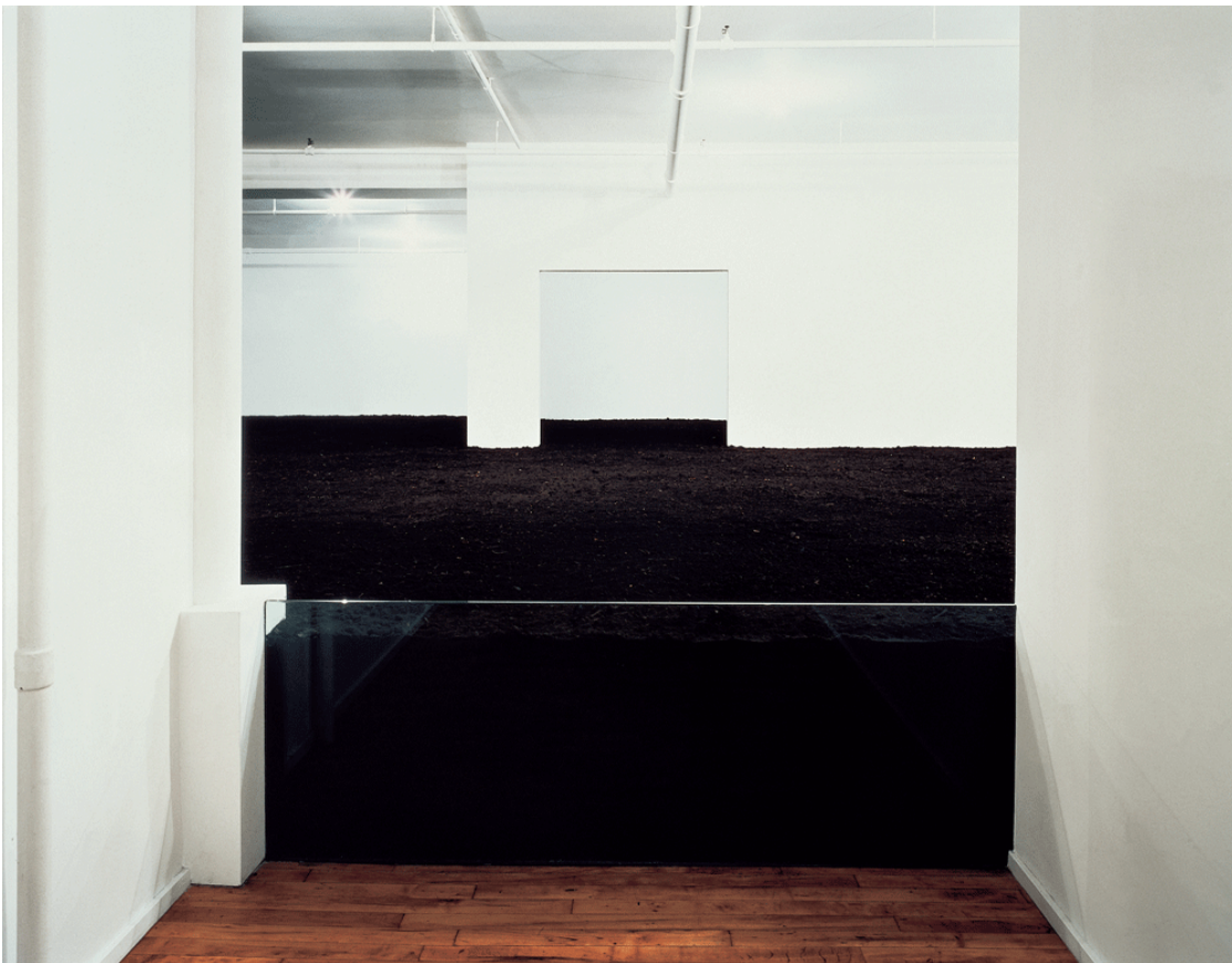
Figure 08. Walter de Maria, New York Earth Room, 1977. Long-term installation at 141 Wooster Street, New York City.