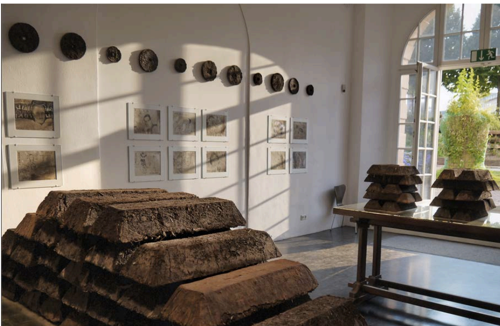
Figure 11. Claire Pentecost, Soil Erg, Installation at dOCUMENTA 13 (2012).

Mounted on another wall of the Ottoneum, like the ghost of an affluent fossil fuel past, is the Richelsdorfer Mountain Cabinet from 1783, a scale model of Hessen’s geologic strata once used for teaching the fundamentals of extraction. Next to the historical cabinet appropriated from the natural history museum’s collection, a new cabinet squirms with worm compost produced in part by the food scraps of visiting dOCUMENTA guests, offset by a list of current “land grabbing” deals between sovereign countries in Africa, Asia and South America and multinational agribusiness concerns. 6